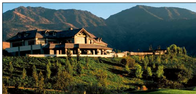
Our New Meeting Locale