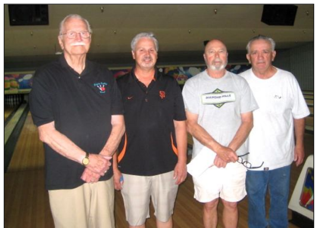
The Silver Foxes