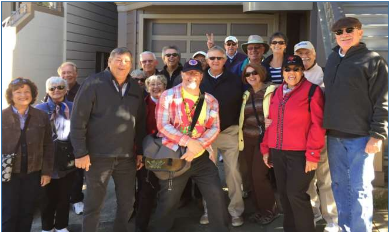
Attached picture in front of the Grateful Dead house:

On Wednesday, November 4, our SIR Branch #19 spent an enjoyable day in San Francisco's eclectic Haight Ashbury neighborhood to recall and commemorate the 1967 Summer of Love. Seventeen folks---including husbands and wives---commuted into the city for a unique and interesting flashback walking tour of the Haight. The focus was on the cultural impact and music coming out of San Francisco's Haight Ashbury community during that late 1960's era. The two hour walking tour included stops at the former residences of Janis Joplin, the Grateful Dead, the Jefferson Airplane, the Diggers community firehouse, and the Panhandle. Our SIR participants and their wives also JM92 had the opportunity to see and learn about the colorful history of the "painted ladies". These are some of the beautiful Victorian homes that have become an integral part of the neighborhood. The seminal Haight Ashbury community is an interesting example of the many different neighborhoods that make up the unique fabric of the urban Bay Area.