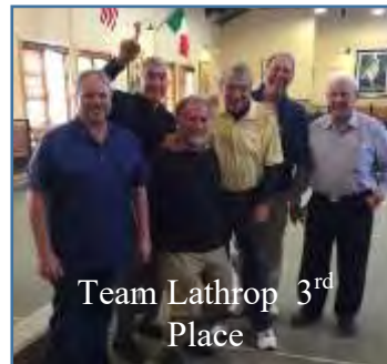
Team Lathrop 3 rd Place