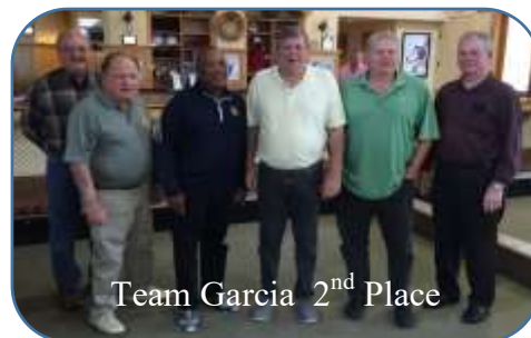
Team Garcia 2 nd Place