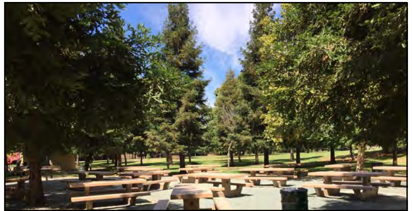
Picnic Site #1- Concord Community Park

Join Us for Picnic in the Concord Community Park (Off Cowell Rd) Thursday, September 21 st , 2017 (11am to 4pm)